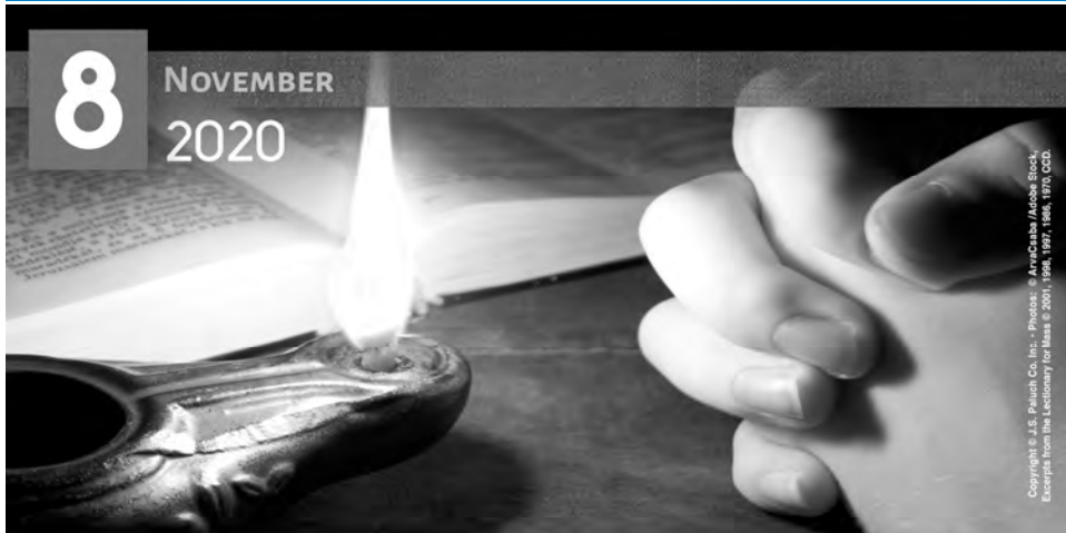
Copyright © J.S. Paluch, Co., Inc. Excerpt from the Lectionary for Mass © 2001, 1994, 1997, 1988, 1970, CDD.