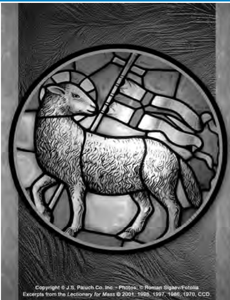
Copyright © J.S. Paluch Co. Inc. - Photos. © Roman Sigayon/Fotolia Excerpts from the Lectionary for Mass © 2001, 1986, 1997, 1988, 1970, CCD.